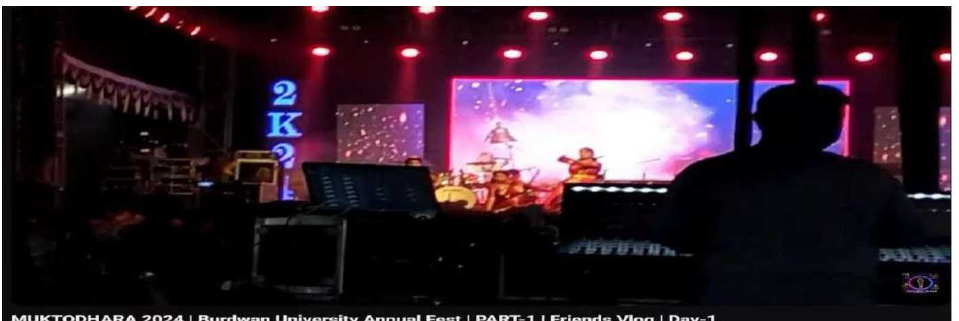
MUKTODHARA 2024 | Burdwan University Annual Fest | PART-1 | Friends Vlog | Day-1