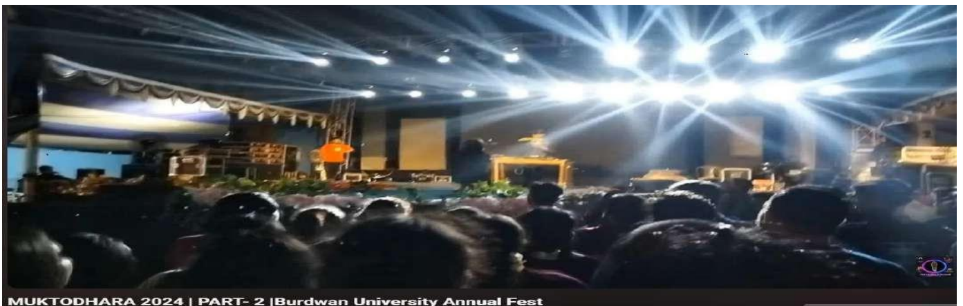
MUKTODHARA 2024 | PART- 2 |Burdwan University Annual Fest