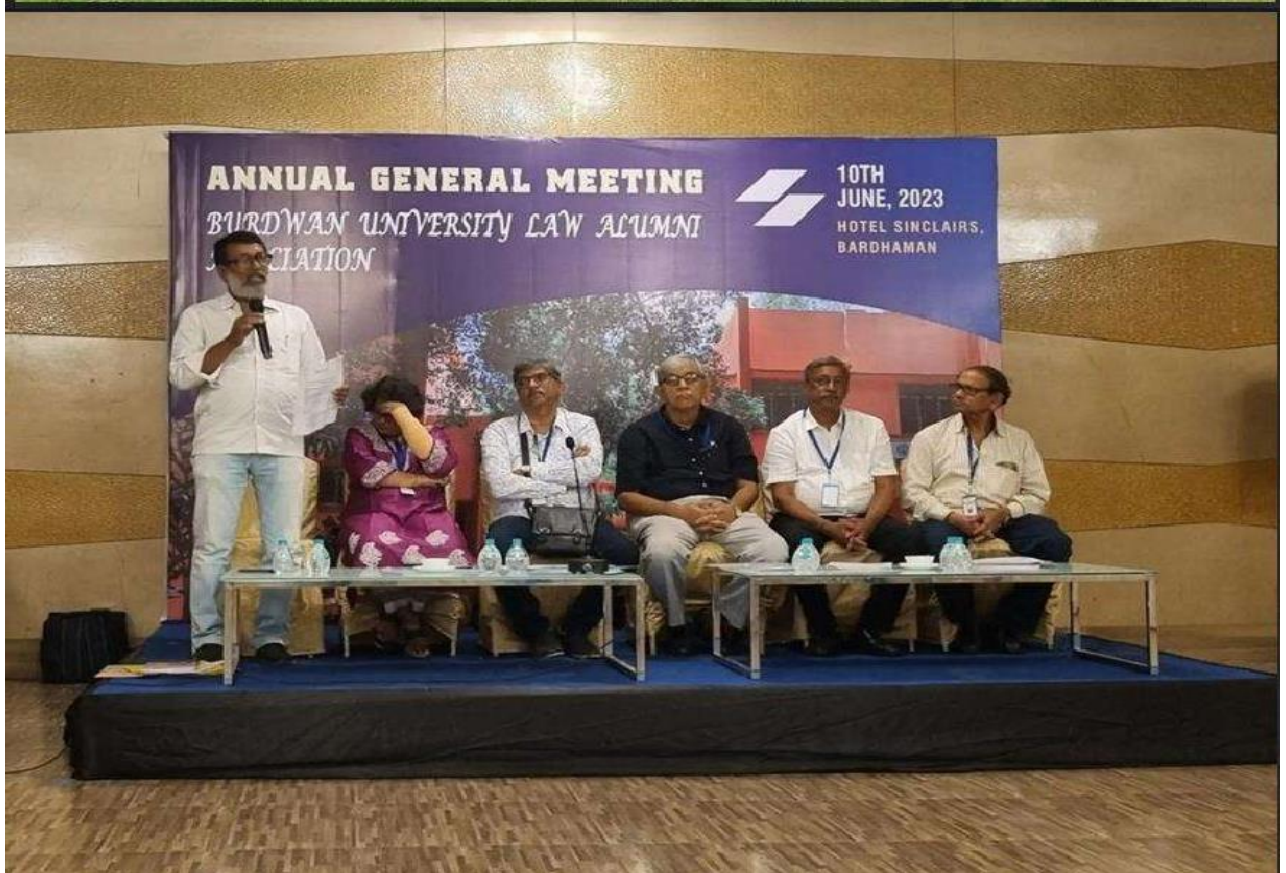
ReUnion/Alumni Meet Department of Law2023