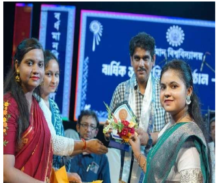
Annual Cultural Programme 2023/2024