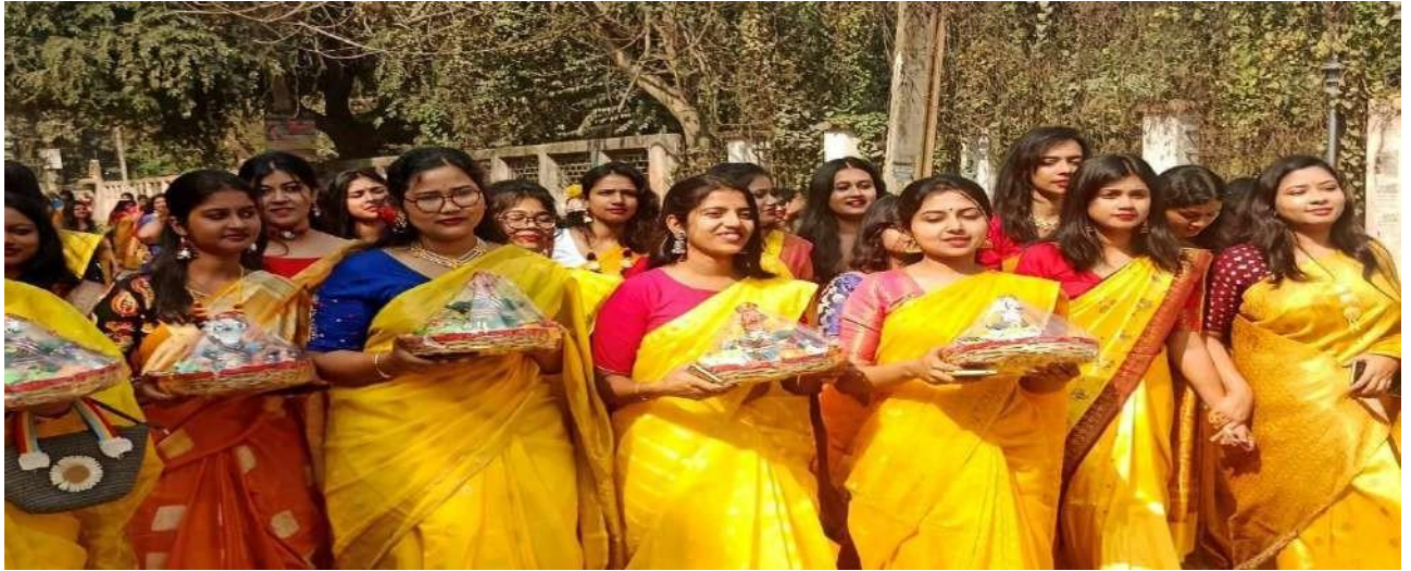
Tatter-Sotto/Basanta Panchami 2022–2024_Cultural Event at University Hostels