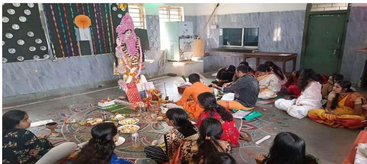
Cultural Programme at Hostels 2022–2024/ Basanta Panchami